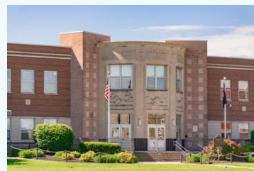
John G. Carlisle (JGC) Elementary School is located in Covington, KY.

The John G. Carlisle staff are, in cooperation with the community, committed to meeting each child's academic, social and emotional needs. CTI is currently supporting the JGC staff in their mission by collecting school supplies for the students of JGC in preparation for the upcoming 2017-2018 school year. By providing school supplies we are able to relieve some of the stress to gather resources needed in the classrooms.