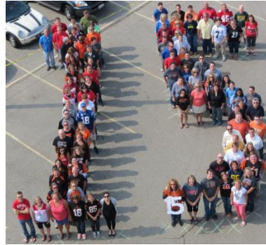
Some CTI employees at our 15 Year Kick-Off Party

American Association for the Study of Liver Diseases Annual Meeting Washington DC – November 1-5